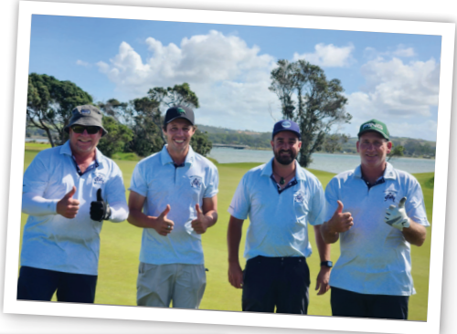
Team Choppa's managed to complete 100 holes in one day!