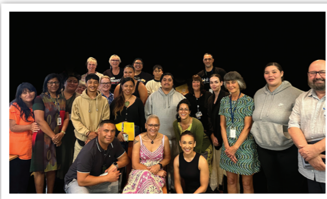
Kia ora - E te iwi ki Domain Lodge. Whānau, Hauora providers and Programme Facilitators pictured.